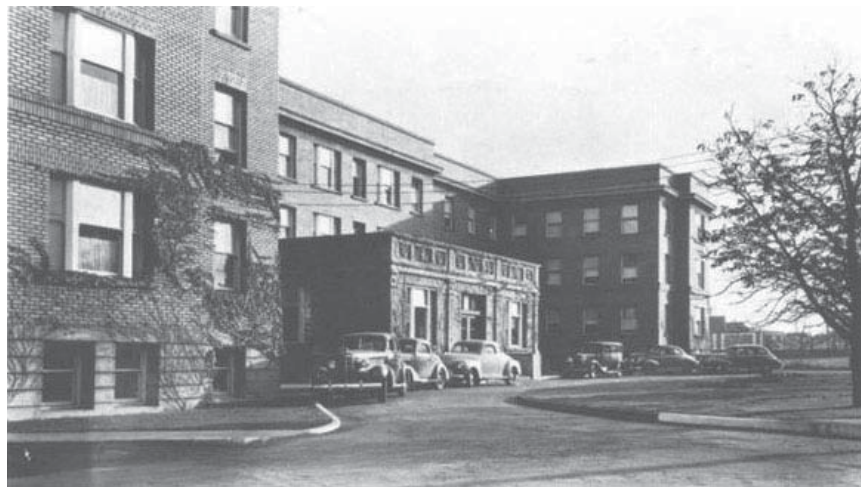
The Royal Jubilee Hospital Nurse Residence.

The grounds of the Royal Jubilee Hospital in Victoria, British Columbia hold a legacy of healthcare and women's history. Two national heritage sites have been acclaimed, Begbie Hall, the Nurses' Residence of the School of Nursing and the 1896 Pemberton Operating Room. Other historical sites include the Pemberton Memorial Chapel, the School of Nursing Alumnae Archives located in the lower level of the Chapel and the Memorial Gardens that surround the site of the Chapel and the Operating Room. This paper will discuss the historical significance of the Royal Jubilee Hospital site and examine the challenges faced in the future.